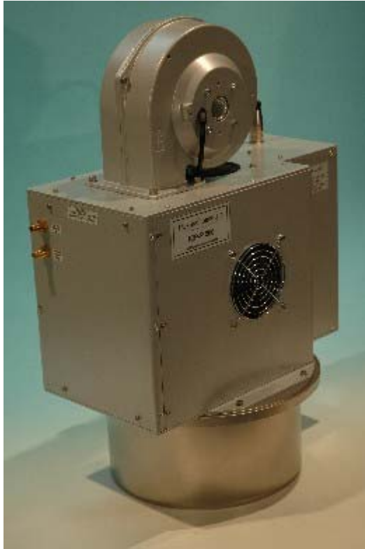
Fig. 1: ICP-P 200