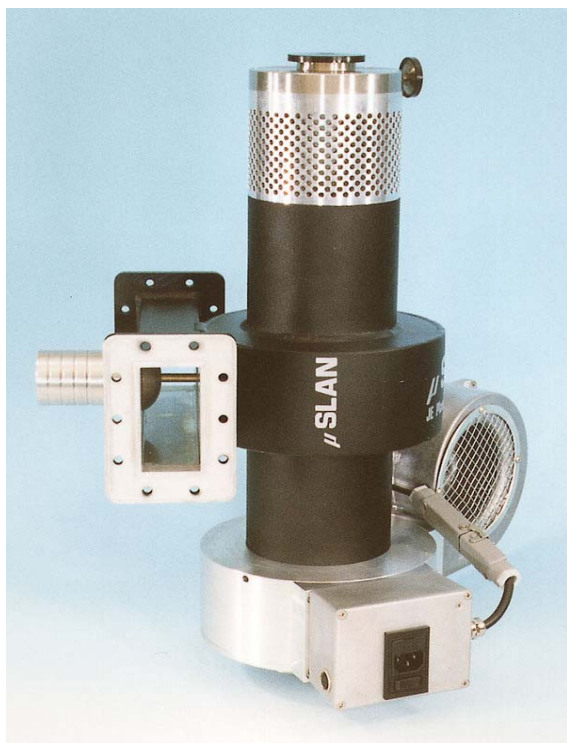
Fig. 1: \mu SLAN